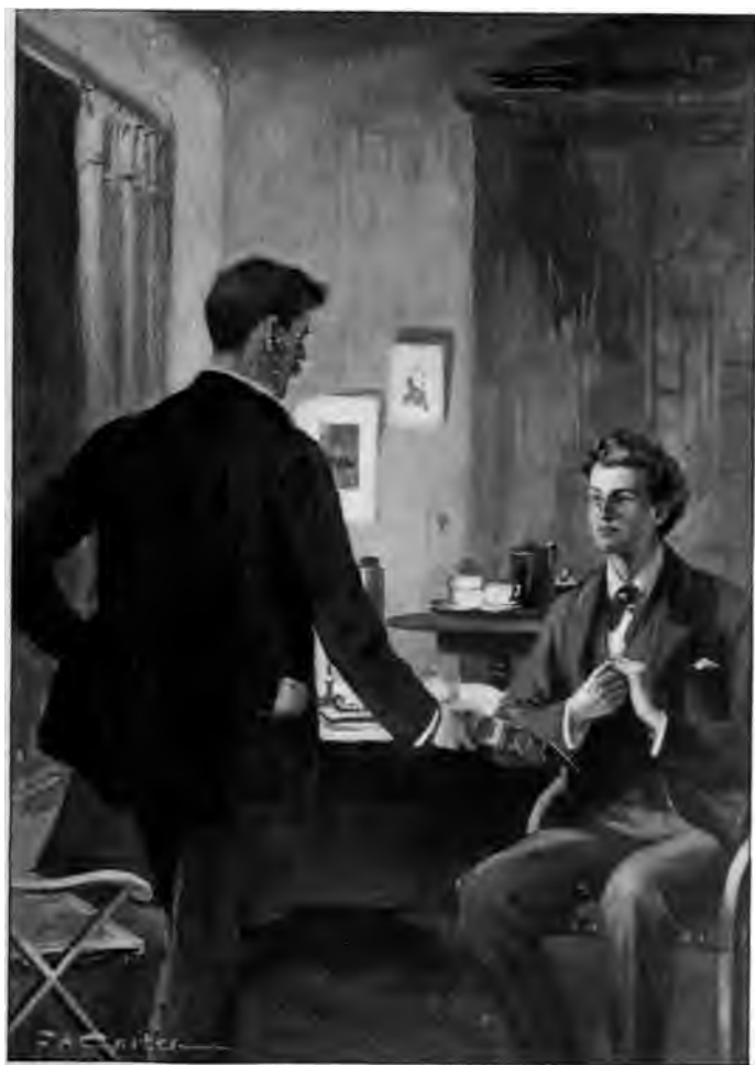
"You smoke, I hope?"—Page 42